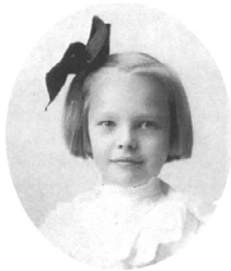
This is a photograph of Amelia when she was four years old.

Amelia Earhart was born in Kansas in 1897. Amelia loved adventure. When she was seven, she decided to build her own rollercoaster. She built a track from a tool shed roof to the ground. She attached roller-skate wheels to a wooden crate and got in. She went down the track fast. She said it felt like flying!